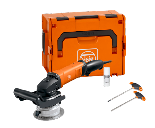
PRICE INCLUDES: 1 KFH 17-15 RT**, 6 Clamping screw, 1 copper paste, 1 Allen key 5 mm, 1 Torx screw driver TX15, 1 L-BOXX