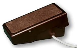
VARIABLE SPEED FOOT PEDAL WITH CONTROL BOX Part Number: 31343751050