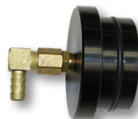
ROTO-STAR III PURGE PLUG Part Number: 31343710100